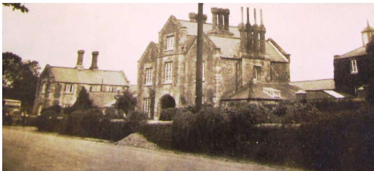
Battle Union Workhouse in the early 1900's, by kind permission of East Sussex County Council. ESRO Ref C/A5/1-2 3